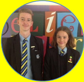
Warwick Year 9 Events Captains