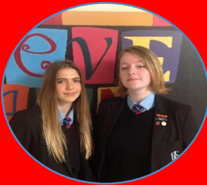
Audley Year 11 Events Captains