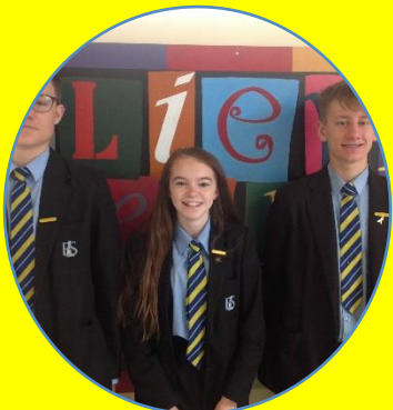
Warwick House Captains