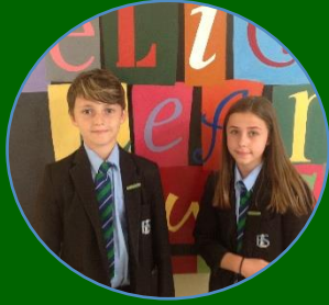
Lovell Year 8 Events Captains