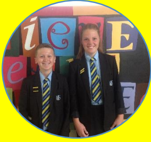
Warwick Year 8 Events Captains