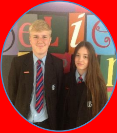
Audley Year 10 Events Captains