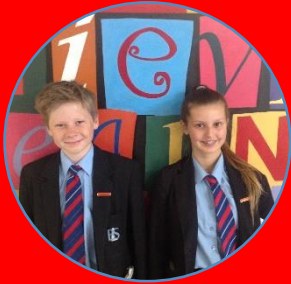
Audley Year 9 Events Captains