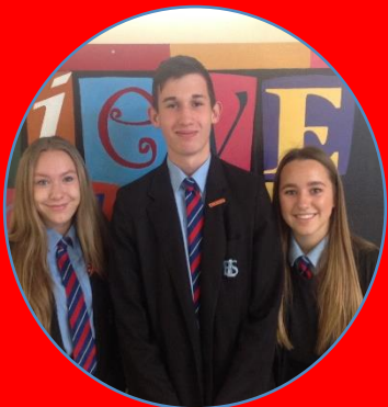
Audley House Captains