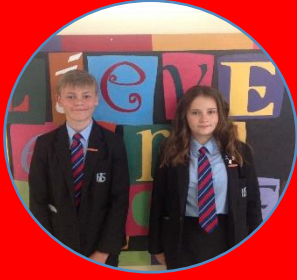
Audley Year 8 Events Captains