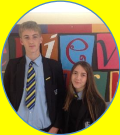
Warwick Year 10 Events Captains