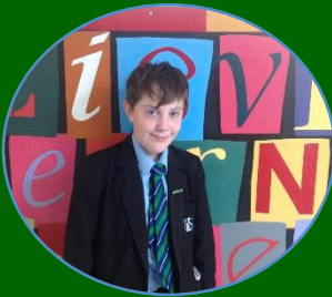
Lovell Year 11 Events Captains