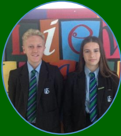
Lovell Year 10 Events Captains