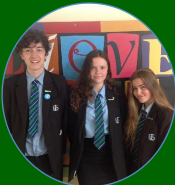
Lovell House Captains