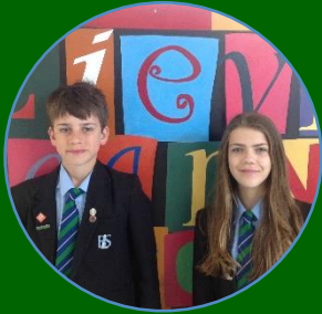
Lovell Year 9 Events Captains